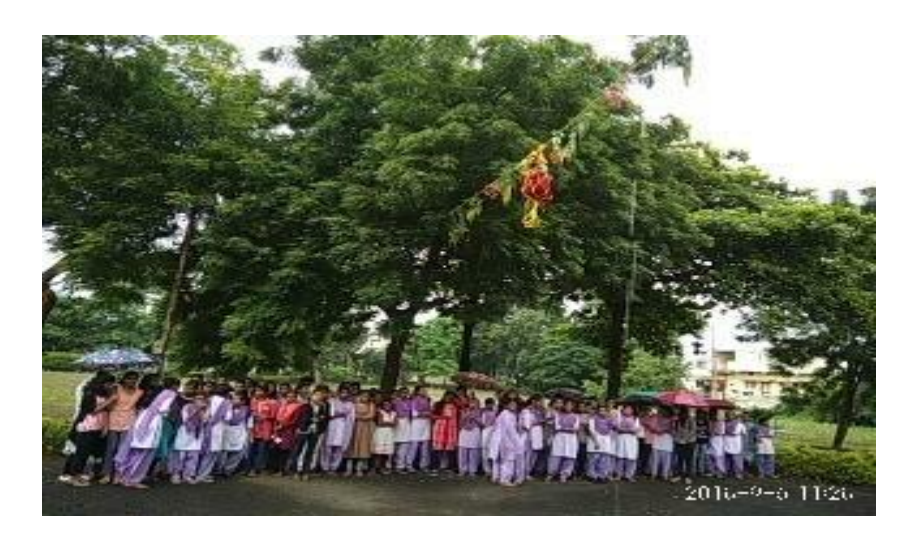
Book Handy 2019