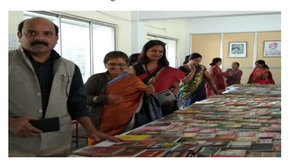
Book Exhibition on Marathi Literature 2018