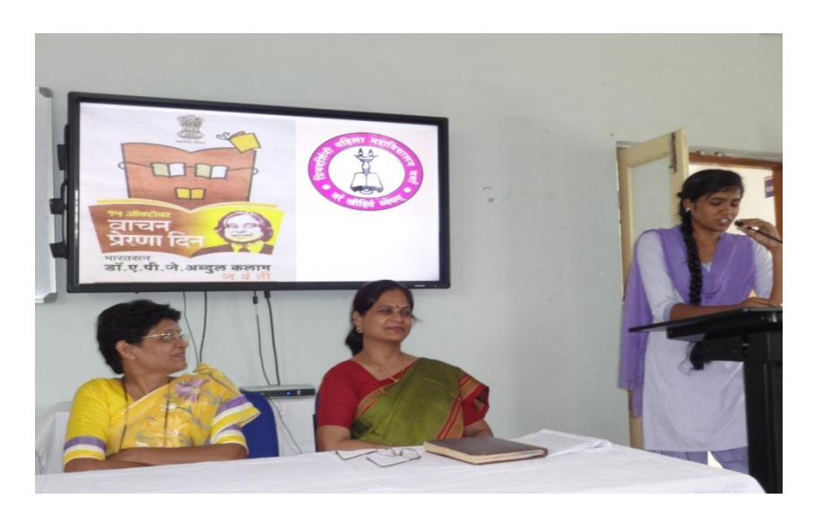
Celebration of Vachan Prerana Din 2016