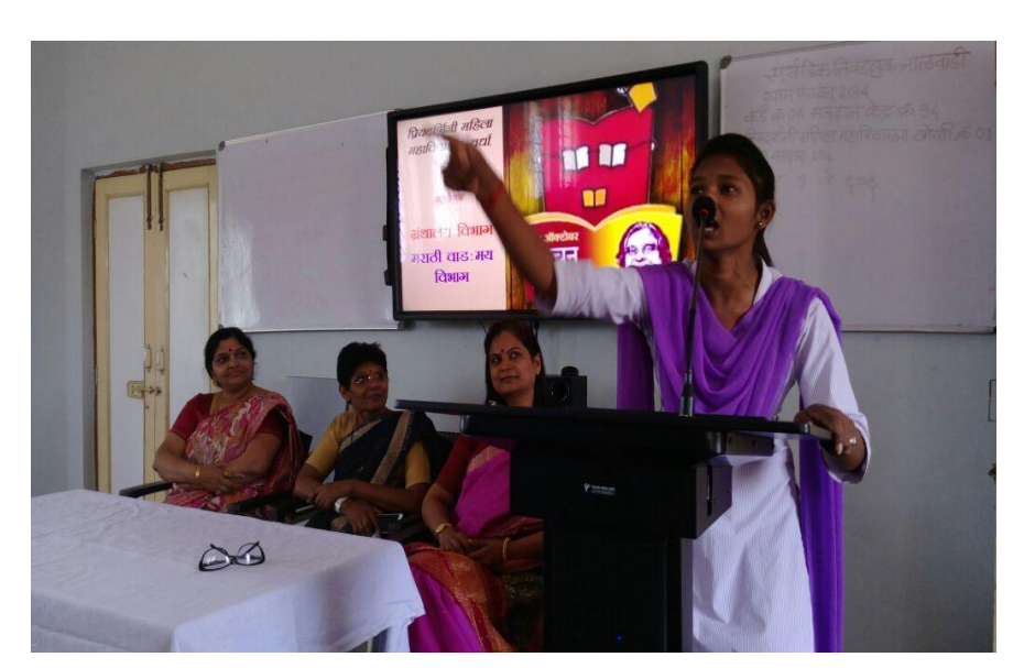
Celebrating Vachan Prerana Din 2017