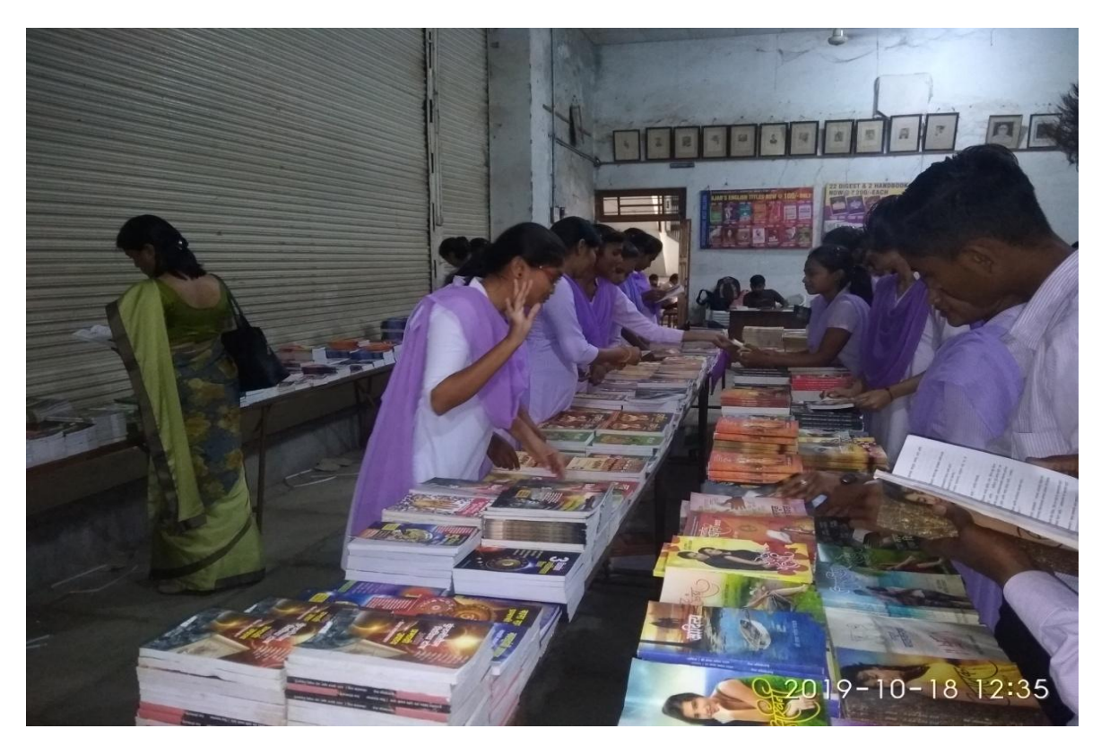
Visit to Book Exhibition 2019